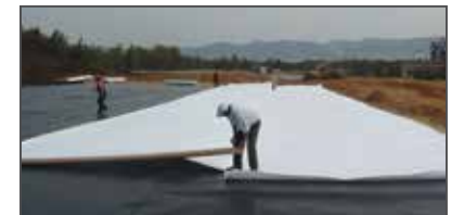
GEOSYNTHETIC CLAY LINERS (GCL)