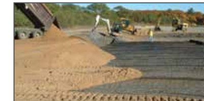
GEOGRIDS & GEOCOMPOSITES