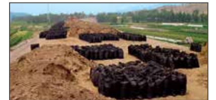
GEOBAGS - GEOTEXTILE TUBES