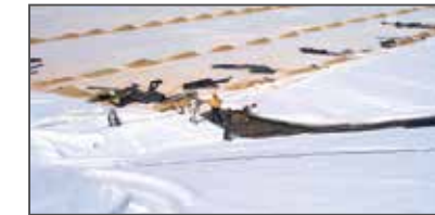
DRAINAGE GEONETS & GEOCOMPOSITES