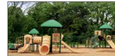
GEOSYNTHETIC REACTIVE CLAY (GRC)