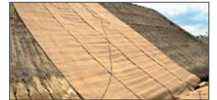
EROSION CONTROL MATS